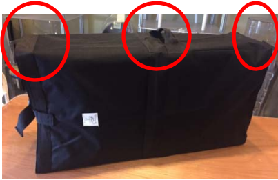
Weaving on top/middle/bottom