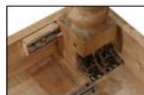
locking foldable hinges