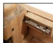
hassle free locking system

* Locking foldable hinges can be sold separately